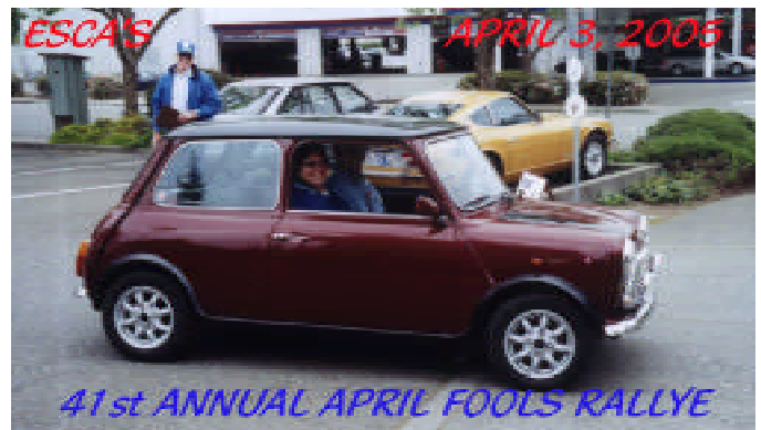
Picture of plaque for 41st April Fools Rallye

Call 1-800-422-0554 to make your reservation.