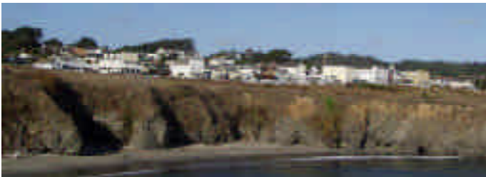
The town of Mendocino

EMPIRE SPORTS CAR ASSOCIATION P.O. BOX 2242, SANTA ROSA, CALIF. 95405