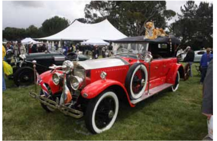
Anyone want to go Tiger hunting?