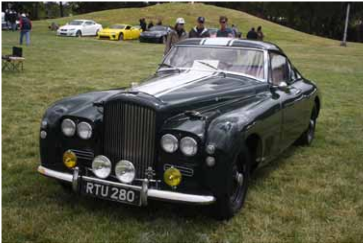
A very nice Bentley