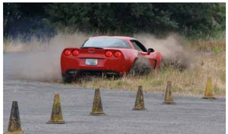
Lesson: "Never go off road with the window down."