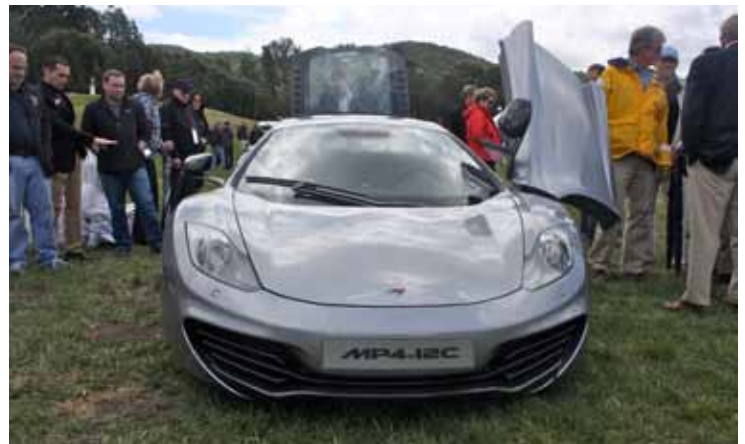
The McLaren MP4-12C