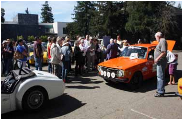
Rallye school at start