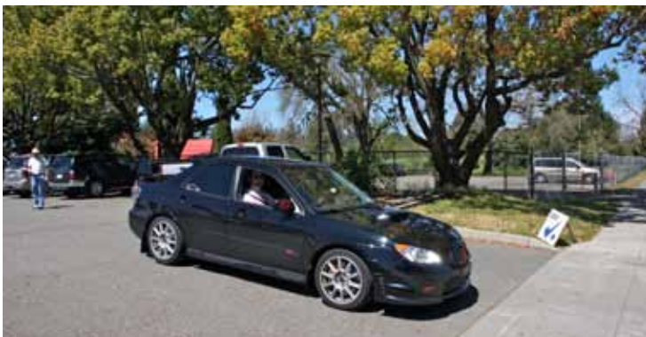
Art & Julie Battles leave start. in their Subaru STI

We got rained out after doing several gimmicks on the video run, but managed to complete it several days later. The Saturday before the rallye check-run found no problems. Then on rallye day morning I headed out for the final check run at 7 AM. Waved to Dale Hartman