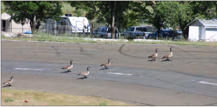
The geese were first