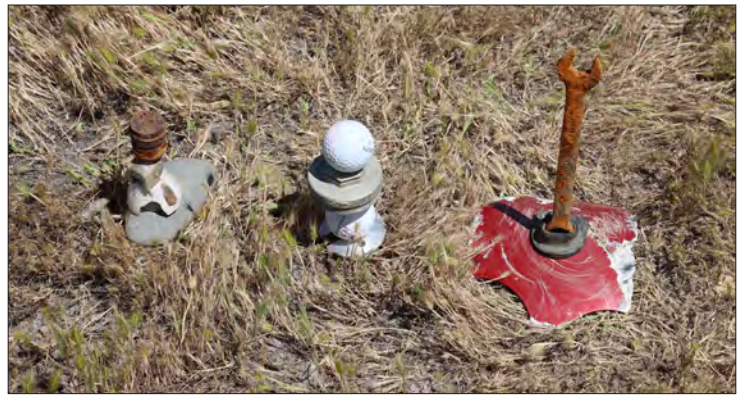
The art project of a course worker with a slow work station