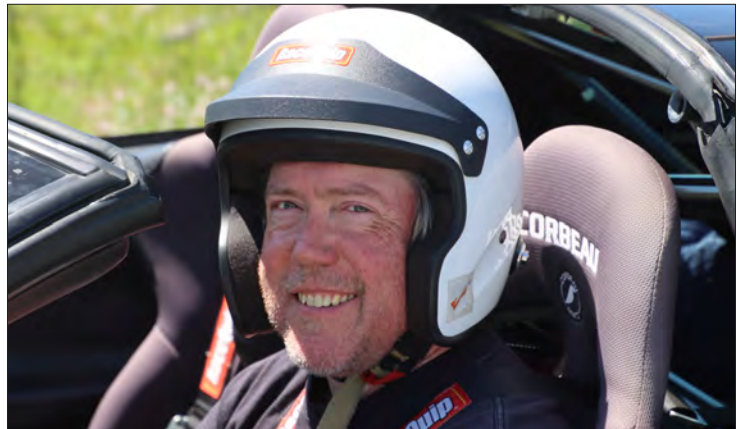
Top Gun Guy Southern