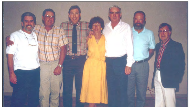
at ESCA 's 50 th Anniversary party. Left to Right