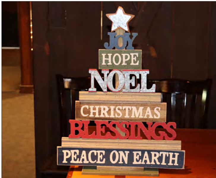
Our Banquet Room greeting

This year we continued the tradition of a toy drive. The toys were delivered immediately after the Banquet. Luckily the rain had stopped for our tour to the Santa Rosa Fire Department.