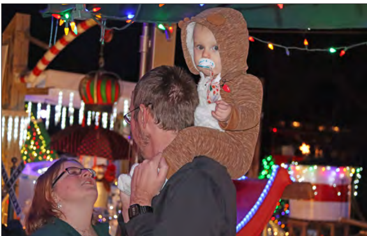
Ending another fun Christmas Lights Tour.