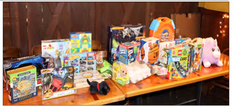
Toys for the kids