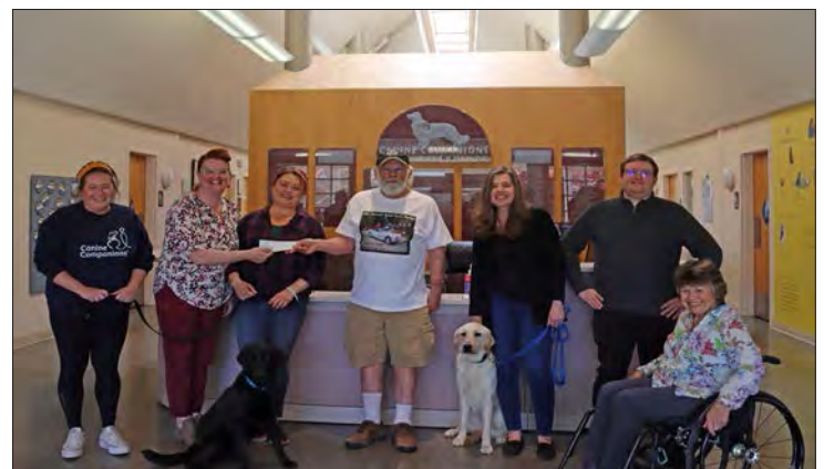
Presenting checks at Canine Companions