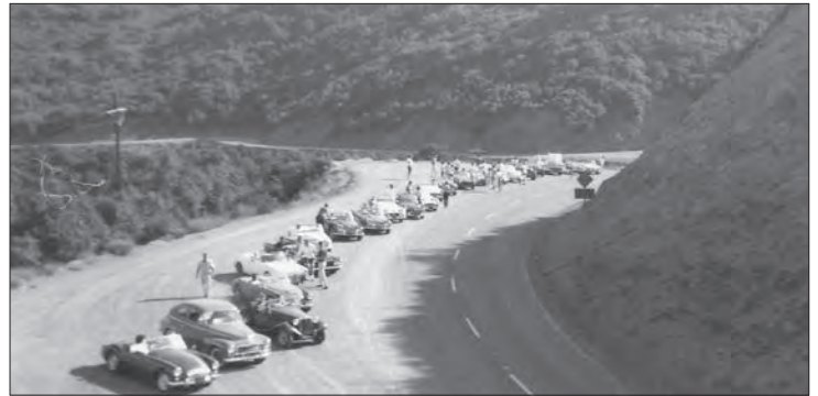
Top of Hopland Grade