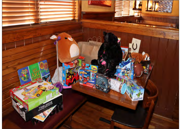
ESCA Toy Donations