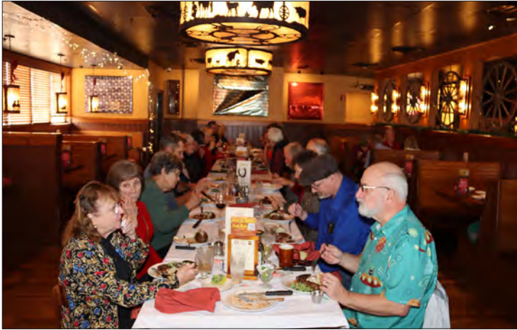
ONE LONG TABLE OF ESCA ns