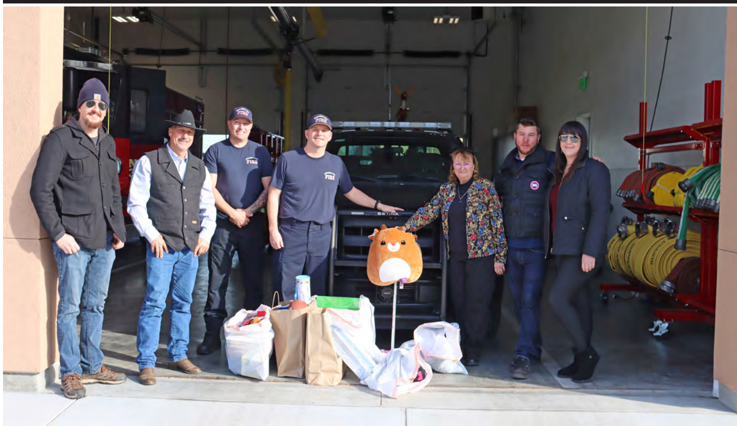
Toy drop off at Fire Station in Rohnert Park. Article on page 3