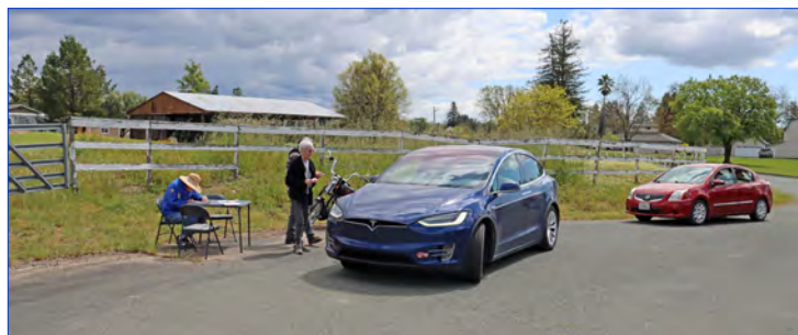
More Rallyists checking into CP 1

Blain for once again serving as the Protest Committee. Blain also provided the final pre-run.