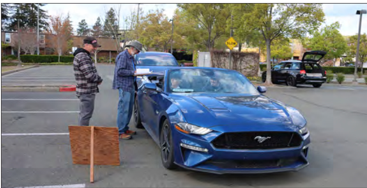
More Rallyists checking into the Finish CP