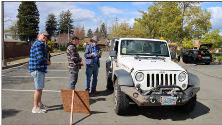
The ESCA team check in the vehicle that drove down from Oregon