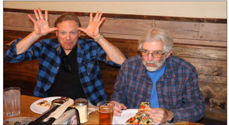
Two of ESCA Rallye workers relaxing after the Rallye