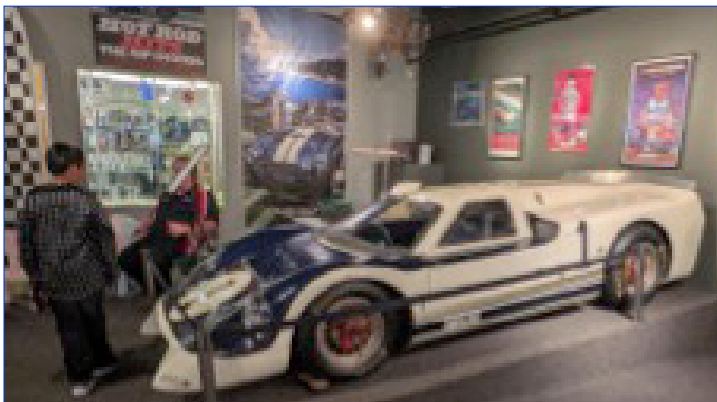
The only surviving Ford J car. Built by Ford from parts to investigate the crash.