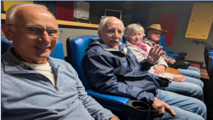
ESCANs in the back row of the small theater.