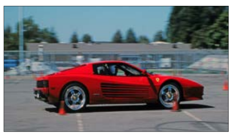
A Ferrari at the Petaluma Park & Ride next to the skateboard track.