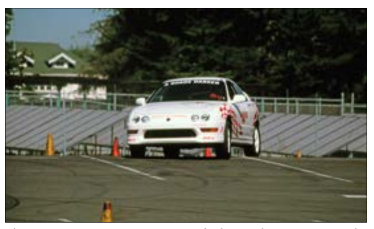
The Petaluma Park & Ride out side the Petaluma Fairgrounds.