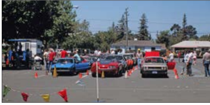
Open Autocross at Santa Rosa Veterans Memorial building we used the west side of the parking lot in 1986.