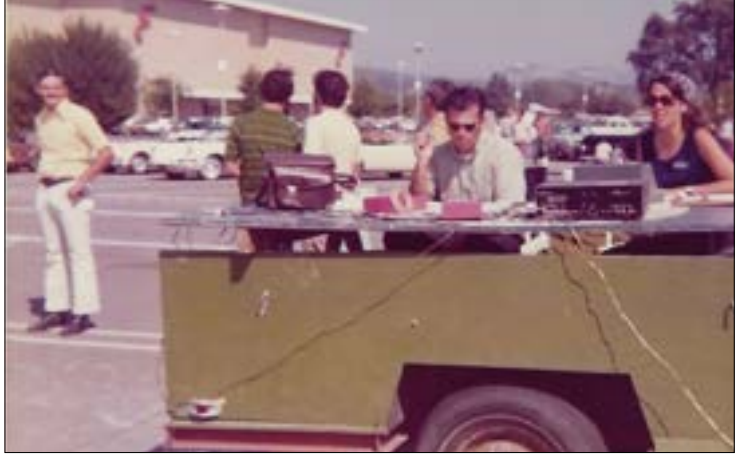
CODDINGTOWN rear parking lot with the second or third ESCA trailer.