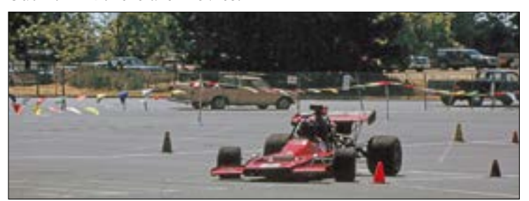
Open Autocross at Santa Rosa Veterans Memorial building we used the west side of the parking lot in 1986