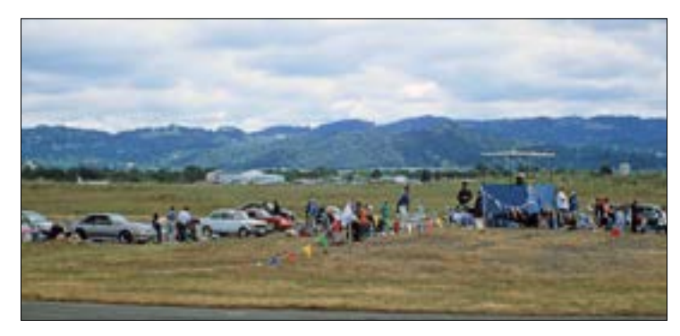
SONOMA COUNTY AIRPORT with the berm down so you could see the airport buildings at an open event.