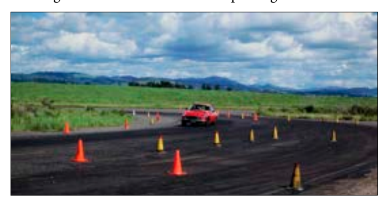
SONOMA COUNTY AIRPORT (SCA) with the berm up.