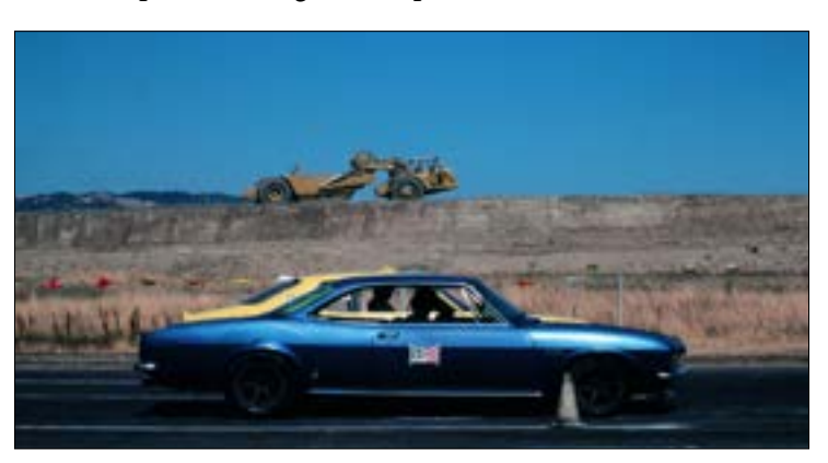
Last autocross at SONOMA COUNTY AIRPORT before the berm came down.