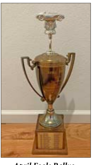
April Fools Rallye First Over-All Winners