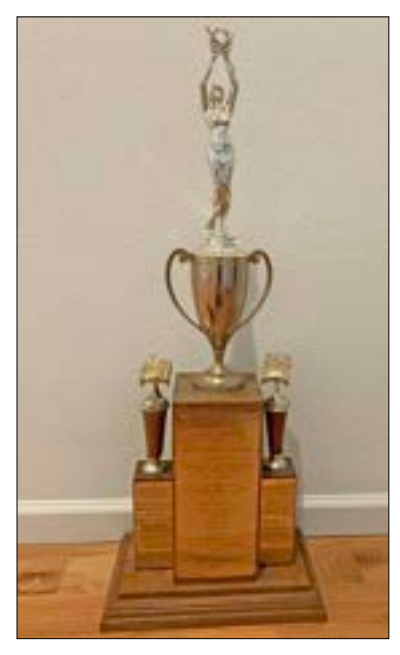
Rallye of the Year Award

The Rallye was able to give a total of $12,075 to Canine Companions For Independence from 2000 to 2024. The Rallye had a great run and was always a favorite with the people who ran because of the friendly workers and scenic route. Another big draw for the Expert Rallyist was getting first overall on the Rallye and getting their names on the big prepetual trophy - maybe that's what kept the Expert Rallyists returning each year. The winners are listed on the ESCA website.