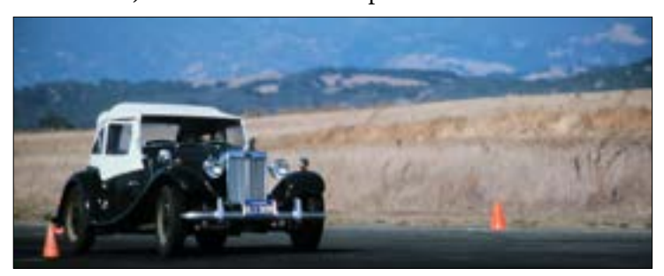
Marci Jenkins' kit car at the Airport.