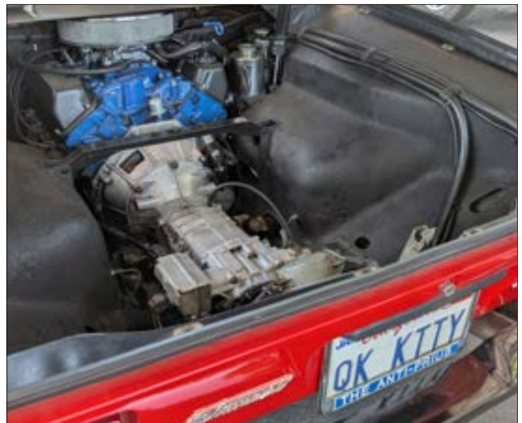
The Anti-Prius, another Pantera...

Look for 2 more articles and pictures of the show in next month's Pit Stop .