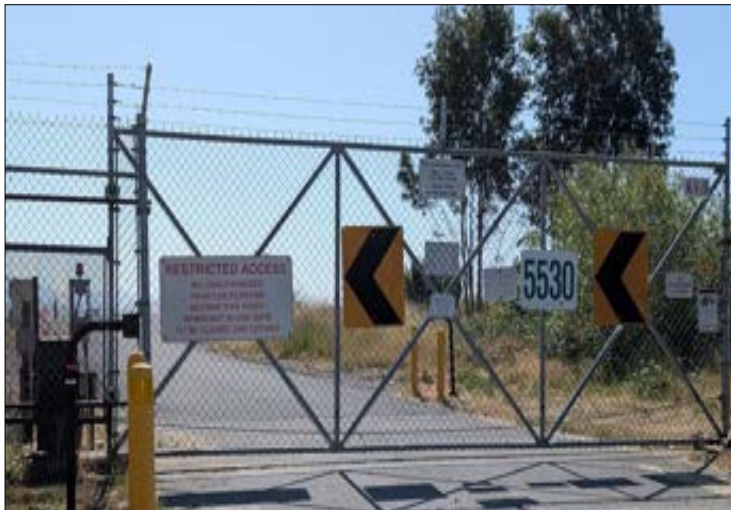
Those were the days . . .

The Tour from the CAMBODIAN DONUT SHOP to the OAKMONT CAR SHOW received a low quantity/ high quality turn out - thanks for bringing the Jag, Michael Bundy. The route (untested) turned out to be well chosen, a nostalgia trip to the back side of the airport to trigger the security cameras at the old Autocross site gate, followed by a mix of twisting lanes and by-roads round the perimeter of Santa Rosa, plus a short detour on 101 due to a road closure wrongly billed as a ramp closure. Ed's blue Honda S2000 was hailed by the owner of a red one, even though he was driving something else. It was that kind of top-down day. The always eclectic OAKMONT CAR SHOW, serenaded by the ever popular Jaydub and Dino, was overflowing with a record 125 entries. Chuck Banks was there with one of three Pantera's. There were over 30 manufacturers