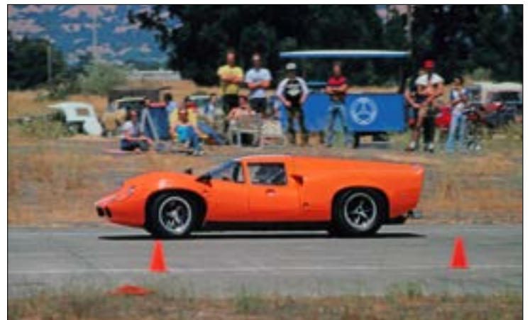
Yes, that is a Lola and I do not know the driver.

A September calendar showed Vintage Races at Sears Point, an ESCA Board meeting in Blucher Valley, an autocross meeting on Post Ranch Road in Santa Rosa, ESCA regular meetings at West America Bank, at the corner of Fulton & Guerneville Roads, a tour to Reno, a ZONC Championship autocross in Pleasanton, and SCCA Can AM Race at Sears Point.