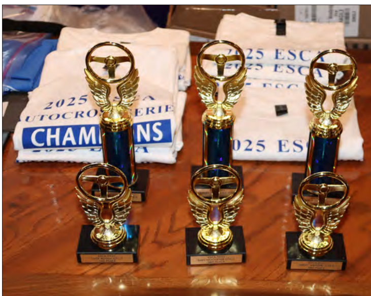
Championship T-Shirts and Trophies