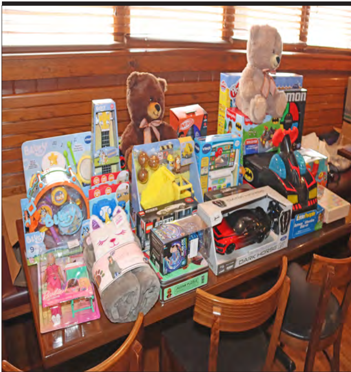
Toys for Kids