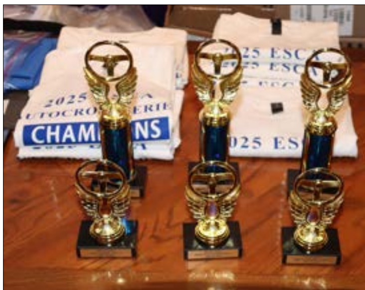
Championship T-Shirts and Trophies