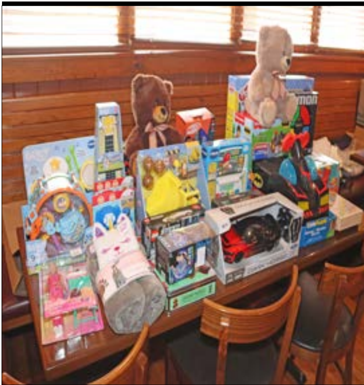
Toys for Kids