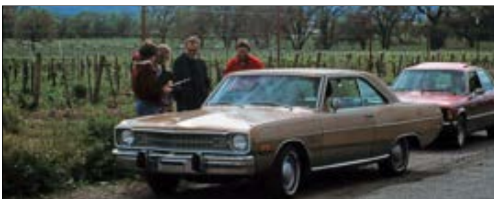
APRIL FOOLS RALLYE checkpoint on Oakwild Road.