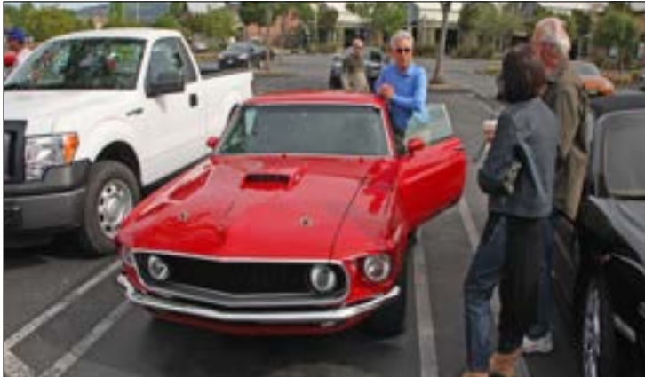
ESCA 7 Car Tour to Novato Cars & Coffee with Lunch at Rancho Nicasio on May 4, 2014