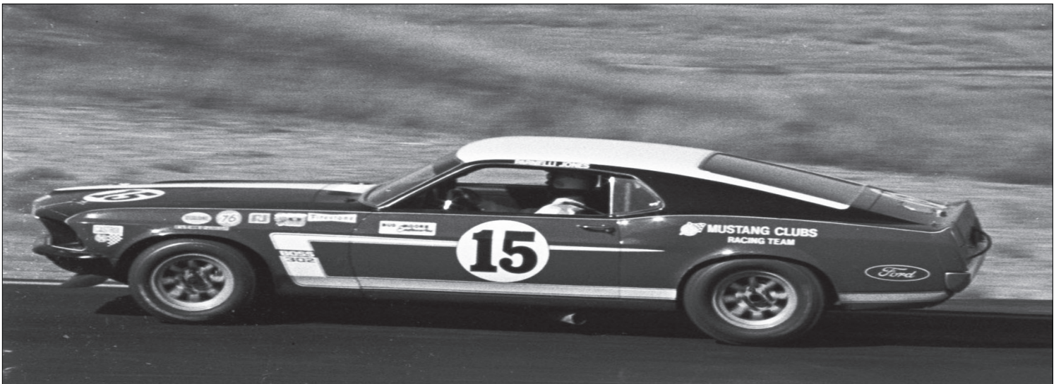
And a shot of Parnelli Jones heading into turn two.