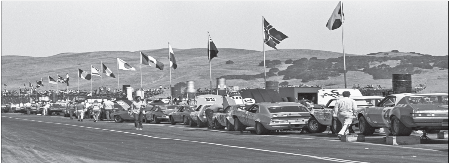
Here's the fancy ultra plush pits at Sears Point 56 years ago.