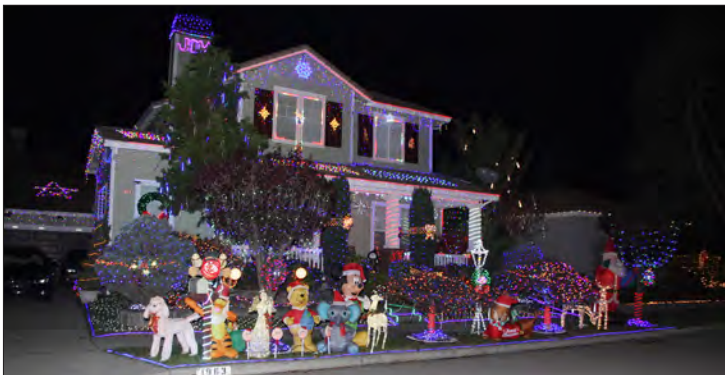
One of the Wow Houses. Thanks to the excellent and detailed instructions by our Tour Leaders!

The tour ended up being sixty miles long and took about three hours to complete with eleven cars in attendance. Everyone seemed to have a great time, including us!