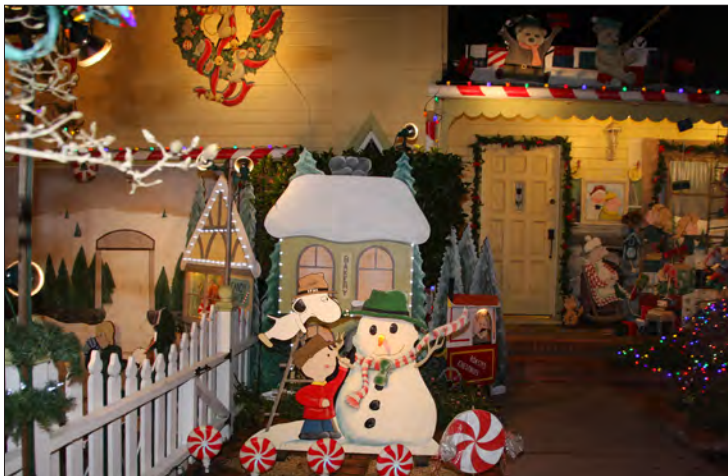
Snowman Lane on Walnut Court