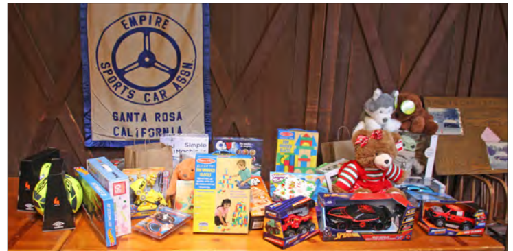
Toys for Kids

We ended the brunch with more socializing and the slide show of 2021 events. (Although, the Annual Christmas Lights Tour was still to be held.) Lastly, we gathered up all the toys and took them to the Santa Rosa Fire House on Sonoma Avenue.