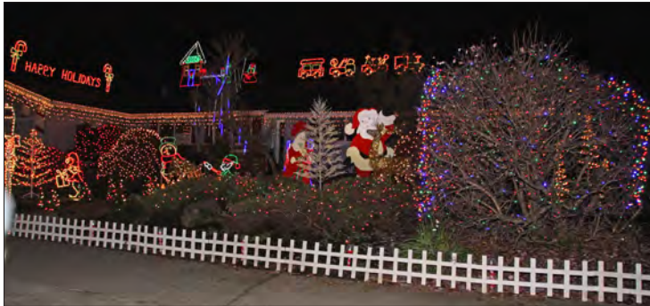
Another Wow House!