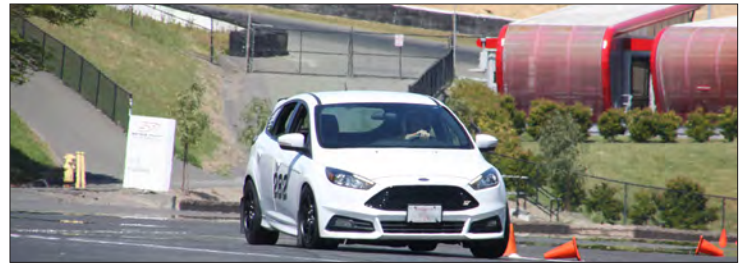
Autocross at Sonoma Raceway Saturday, March 19, 2022

Exclusive Track Days is holding an autocross in the paddock behind the main grandstand while, ESCA will be running the autocross and it will be the first event in ESCA 's series.